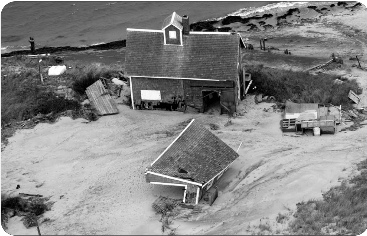
A Nauset Beach home destroyed by a 2007 storm. As was noted in the Massachusetts Supreme Judicial Court's ruling, damaged structures like the one in this photo can create debris that may threaten other structures.

picked up off its foundation and floated away by a severe storm, potentially damaging neighboring homes. The defendant offered testimony that efforts to evacuate the home during a flood would pose risks to rescue workers, as well as the home's occupants.