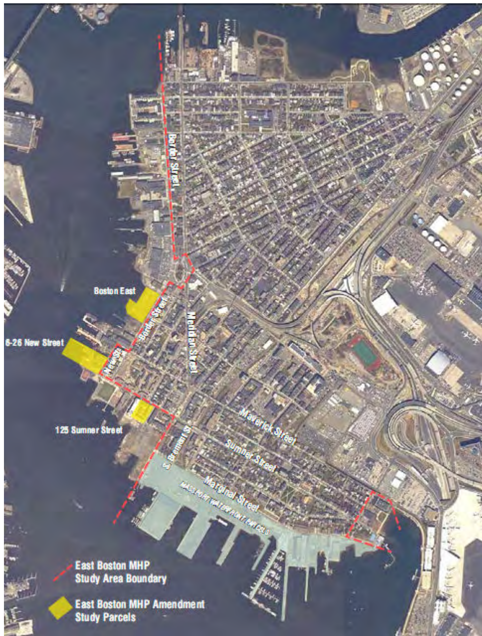
Figure 1. East Boston Planning Area